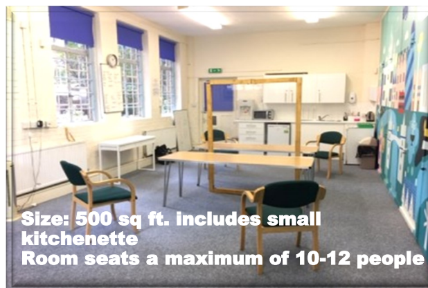
Size: 500 sq ft. includes small kitchenette Room seats a maximum of 10-12 people